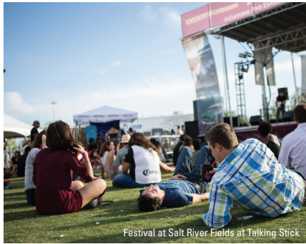
Festival at Salt River Fields at Talking Stick