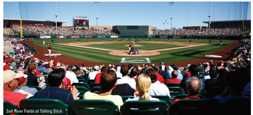
Salt River Fields at Talking Stick

Training game at Salt River Fields at Talking Stick , and head over to OdySea Aquarium for an up close and personal Penguin Encounter or behind the scenes Shark tour . Be sure to tour Butterfly Wonderland , the largest indoor butterfly pavilion in America for a butterfly release and Flight of the Butterflies 3D movie . Families interests vary and so do our activities with the Talking Stick Entertainment District where adventure awaits for much needed bonding time at Top Golf , kart racing at Octane Raceway , roaming among dinosaurs at Pangaea Land of the Dinosaurs or get your kinks out skateboarding or Parcoring at KTR . Storytelling is our specialty with a special experience at the Titanic Artifact exhibition .