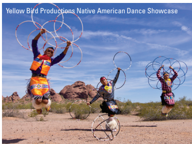
Yellow Bird Productions Native American Dance Showcase

Native American tribes vary widely in lifestyle, customs, and art, but during pow-wow season, they all come together to celebrate