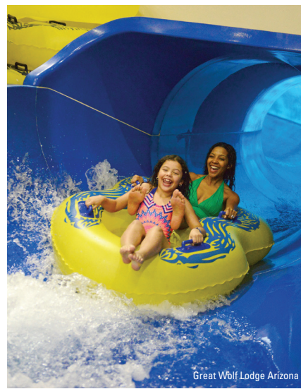
Great Wolf Lodge Arizona