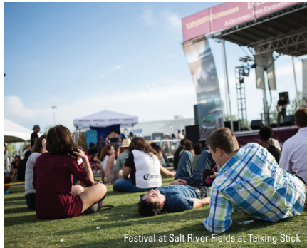
Festival at Salt River Fields at Talking Stick